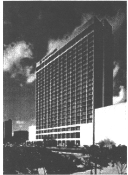
The Westin Galleria Hotel

The Mall features more than 350 fine stores and restaurants, an impressive ice rink and two Westin hotels. This