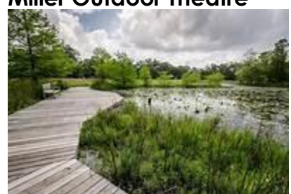
Houston Arboretum & Nature Center