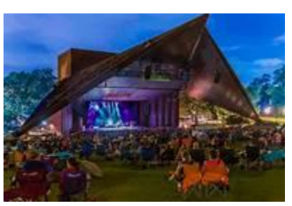
Miller Outdoor Theatre